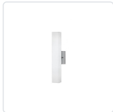
WS8418-BN Brushed Nickel